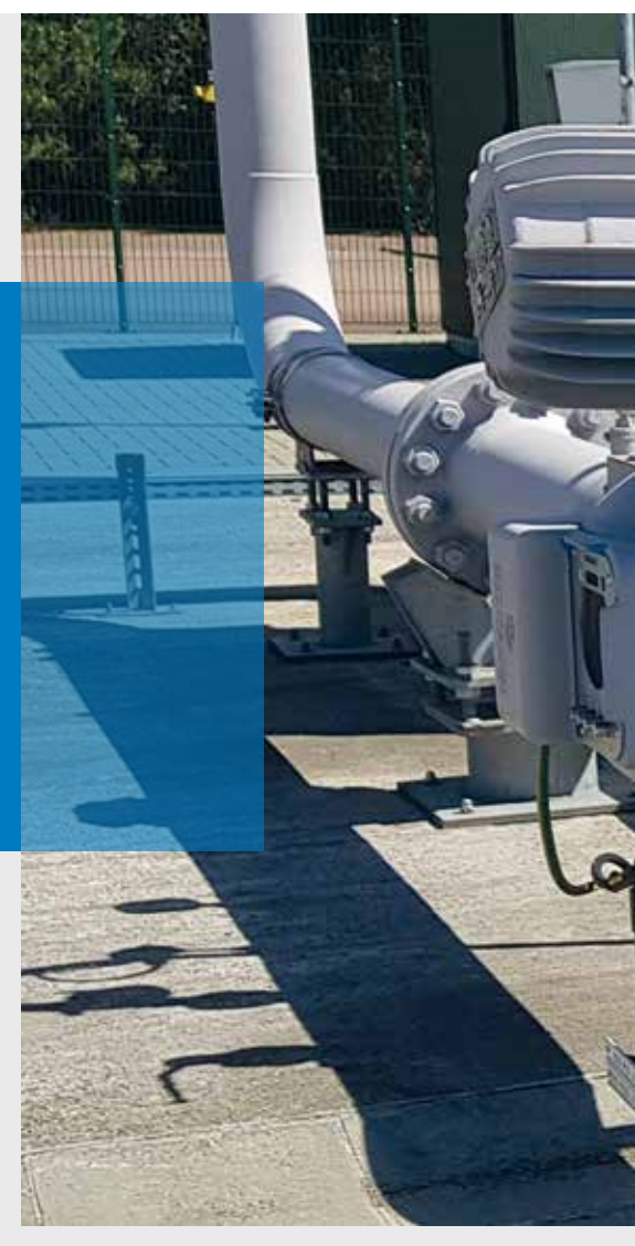
Split body control ball valve at VNG underground gas storage site

Fully welded ball valve at Thyssengas gas compressor station